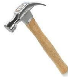
“Private Company” Tools