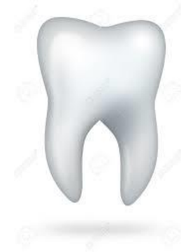
“Private Company” Dental Insurance