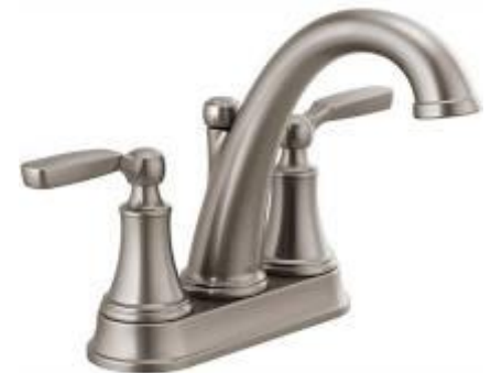
“Private Company” Faucet