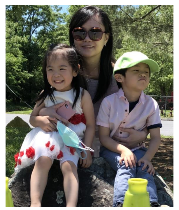
Where do you work and what do you do?

Introducing your fellow members and showcasing the diversity of the WSS membership