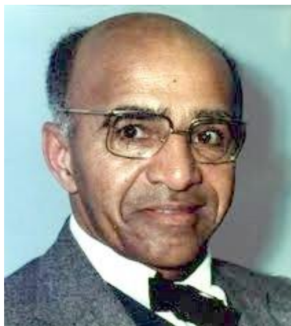
Dr. David Blackwell

Dr. David Blackwell, a mathematician and statistician, made phenomenal contributions to probability theory, statistics and game theory and was the first black scholar to be admitted to the National Academy of Sciences passed away on July 8, 2010 at the age of 91. Even though he encountered the many difficulties that African Americans experienced in society, and in particular, the mathematical community, he prevailed to become the " greatest African American mathematician ". He came to Howard University in 1944 and in just three years, he was appointed to full professor and head of the Mathematics Department. In 1954 he left Howard to go to University of California, Berkeley where he spent the rest of his career. At Berkeley, he became the first black tenured professor.